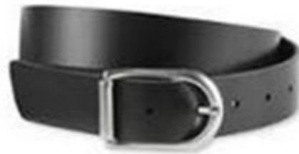
Black Belt Pants must be worn with a belt