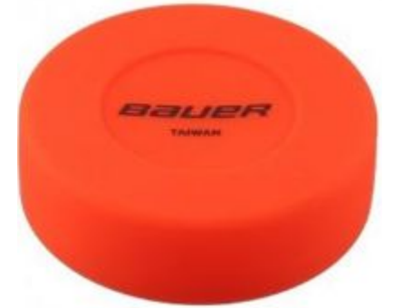
Ball Marker / Puck