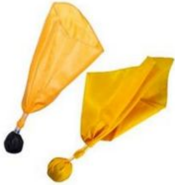
2 Yellow Flags