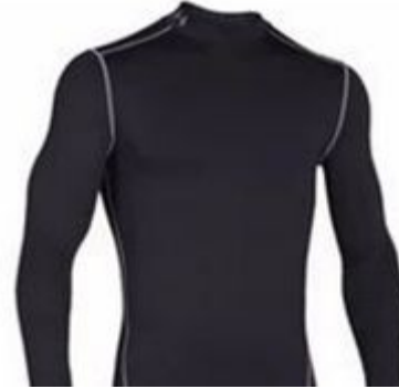
All visible undergarments must be black