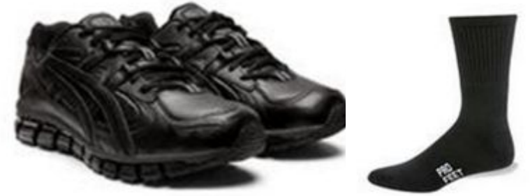
Shoe and socks must be mostly black