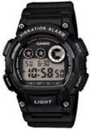
Timing Watch Do NOT use Phone