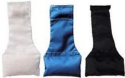
Throw Down Bean Bag color is optional