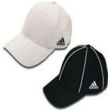
Black with Piping